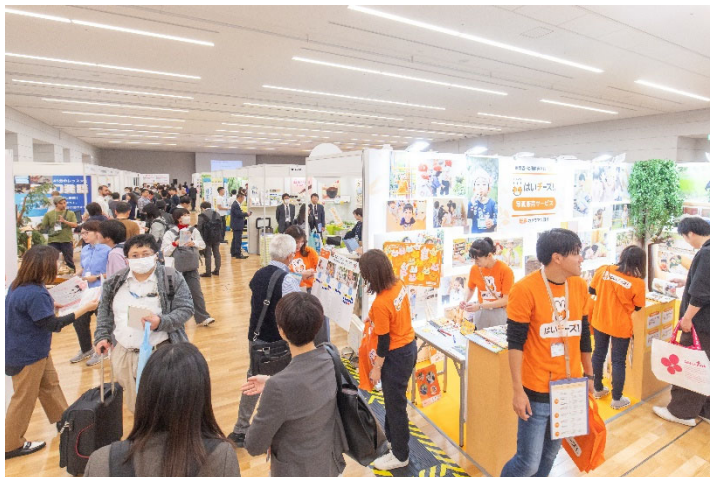
Participants engage in insightful seminars at Child Edu & Care Japan 2023.

The fair, which fosters innovation and collaboration in the field, featured a diverse array of companies showcasing their products and services. The bustling exhibition hall saw enthusiastic engagement between exhibitors and visitors, comprised of individuals from all kinds of childcare facilities. The participating companies, including ANEBY Co., Ltd., Oisix ra daichi Inc., Kao Professional Services Co., Ltd provided a rich tapestry of offerings, addressing the diverse needs of childcare providers and educators.